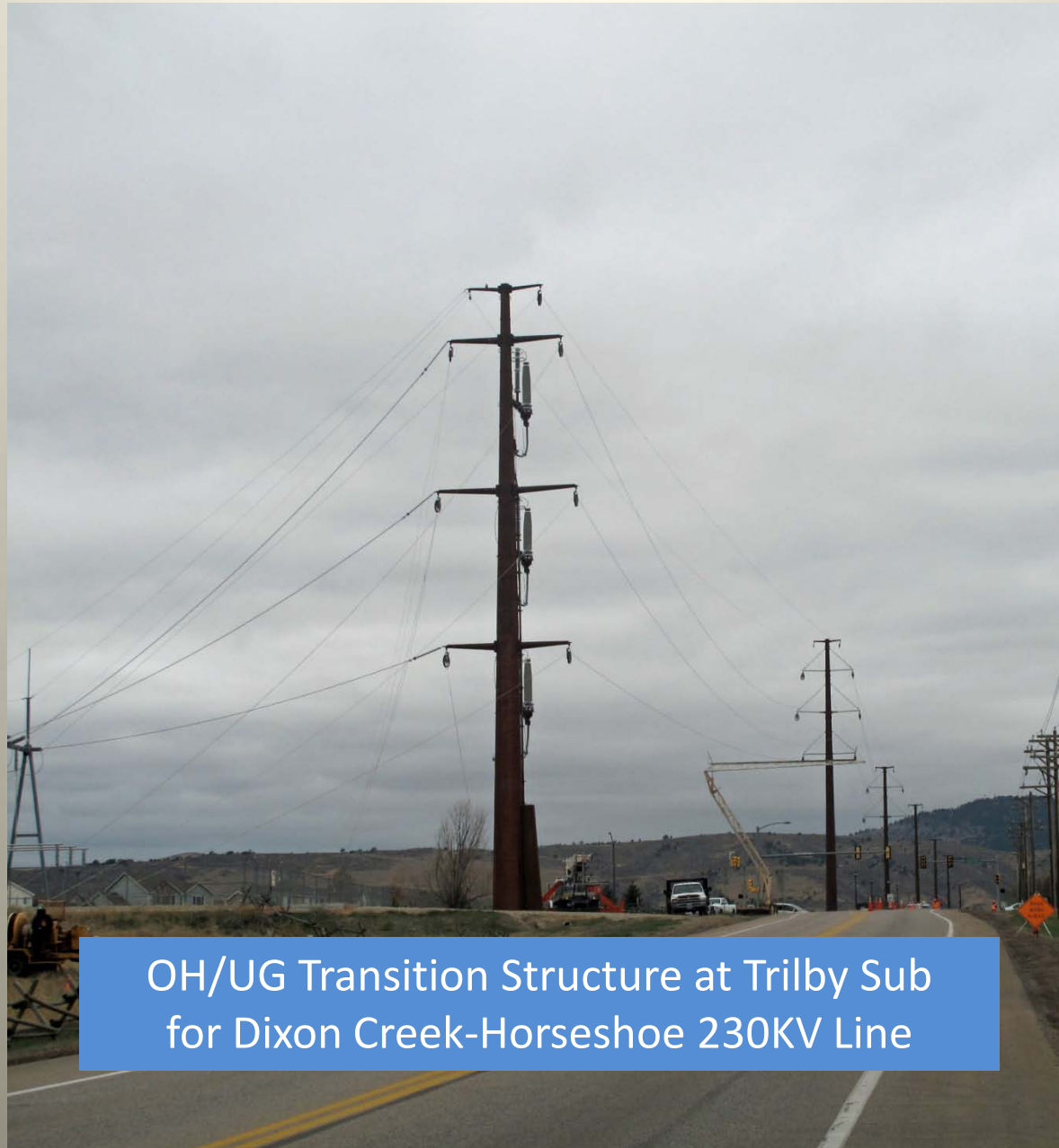
OH/UG Transition Structure at Trilby Sub for Dixon Creek-Horseshoe 230KV Line